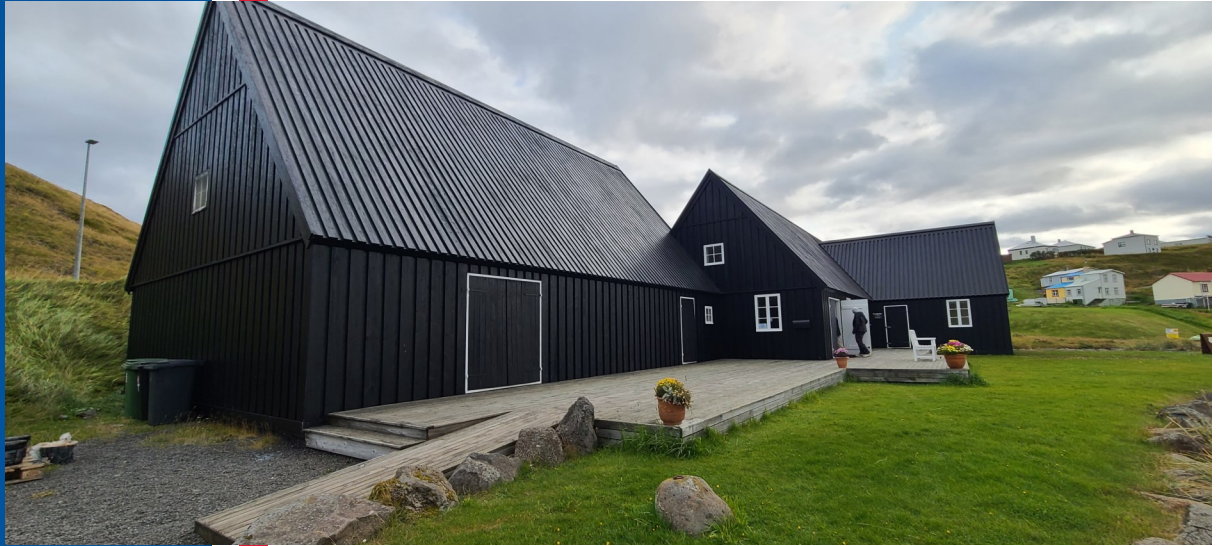
The Icelandic Emigration Center in Hofsvós